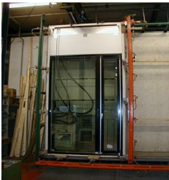
Single element testing on inside Test rig