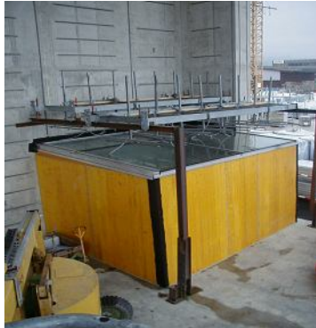
Performance tests on our outside testing facilities, e.g., vertical glazing and roof glazing